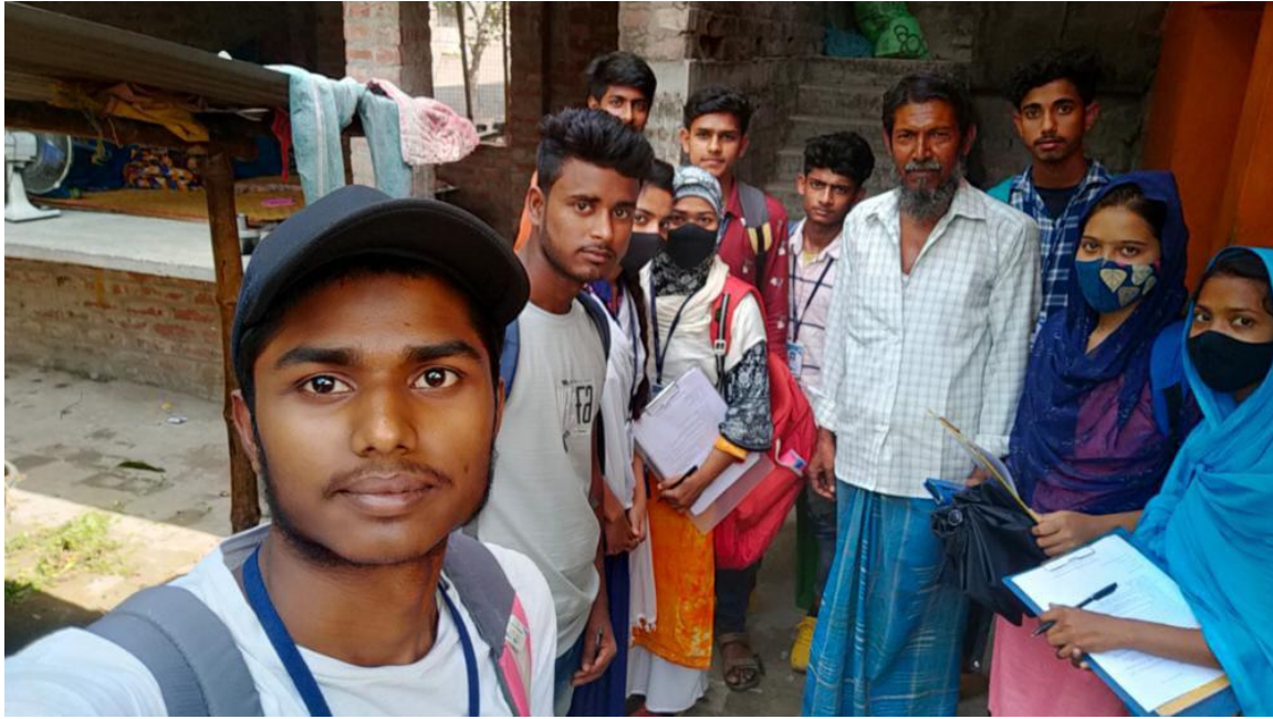
Survey is going on-3 Dated-23 th April 2022