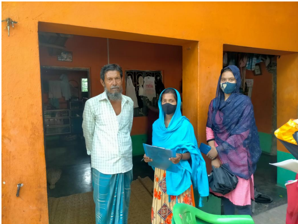
Survey is going on- 4 Dated-23 th April 2022